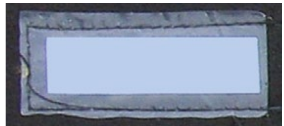
Hydrocarbon Detection Strip placed against outer skin.