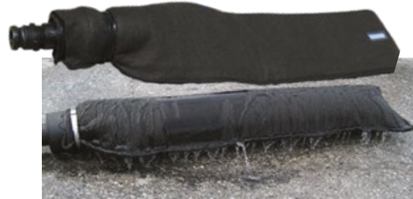
EVAC Filtration System filtering water.

* Listed on the EPA National Contingency Plan Product Schedule as a "Solidifier" for use on oil spills in the navigable waters of the United States.