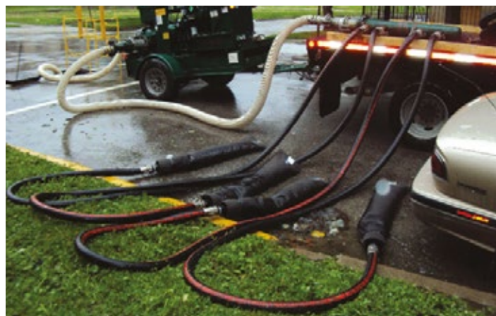
Multiple EVACs can be used with larger pumps with a multi-port manifold.