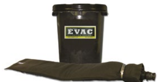
Liquid-tight container. Optional