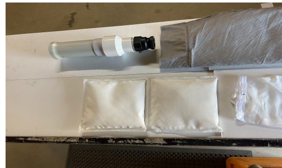
Camlock quick connect fitting. Female fitting is also available.