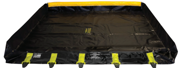
Clean lines of the berm with no obstruction either on the bund interior or exterior.

Fail-Safe® flotation device incorporated on entry/exit walls.