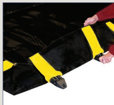
A simple tug locks supports in upright position.