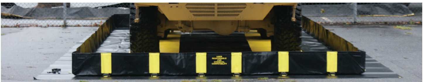
Reinforced, wraparound design prevents seam leaks for fluid-tight reliability.