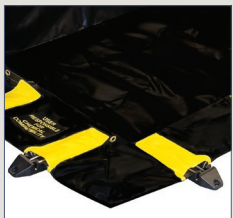
Unfold bund, exposing supports in flat position.

No assembly needed— saves time, ready in minutes!