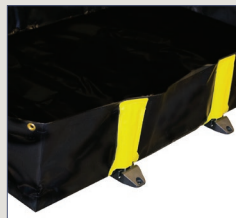
Fully deployed for quick spill readiness!

Fail-Safe® flotation device incorporated on entry/exit walls.