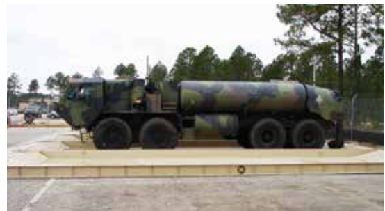
Innovative design requires no assembly during setup and no disassembly to relocate.

The fully tested, innovative design eliminates the risk of gasket failures and allows you to relocate or reposition the unit without disassembly. Optional integrated ramps allow you to customize the unit to your needs.