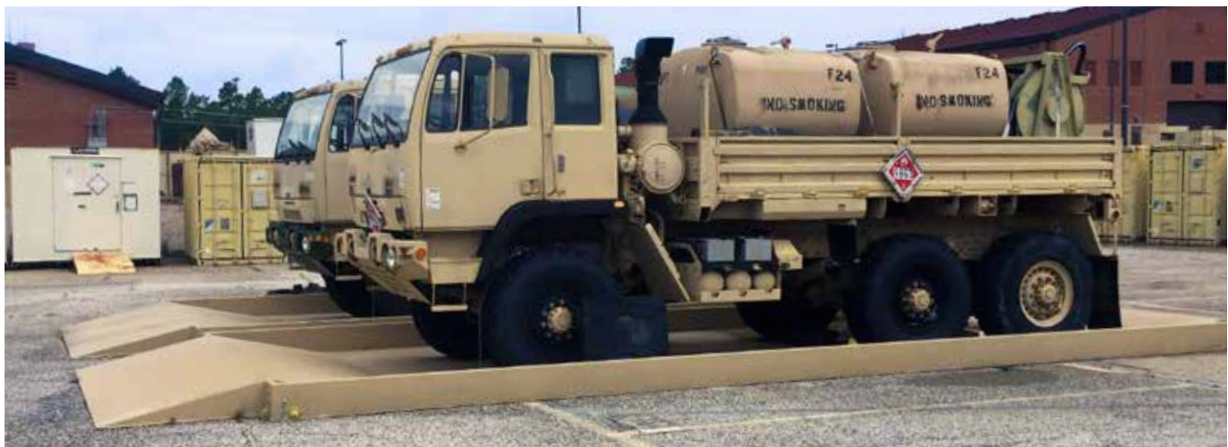
Contains fuel trucks as well as fuel pods.