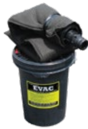
EVAC Filtration System