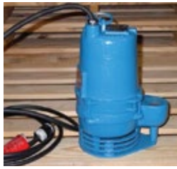
Submersible centrifugal pump, hose(s) and connectors.