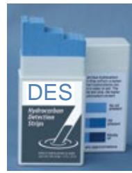
Hydrocarbon Detection Strips