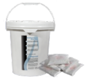
Oil Solidifying Polymer Granules in Bucket and Dissolvable Packets