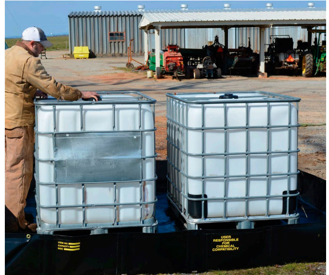
Affordable spill containment for small to big scale applications.