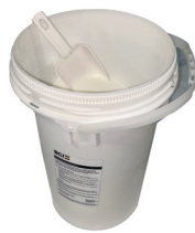
10 lbs. LOOSE 6.5 GAL PAIL SKU: CIA010