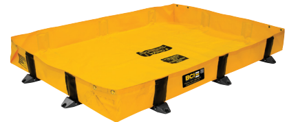
One piece, no assembly needed or parts to lose. Fully operational in just minutes!