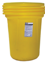
50 lbs. LOOSE in 30 GAL. DRUM SKU: CIA050