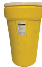
100 lbs. LOOSE in 55 GAL. DRUM SKU: CIA100