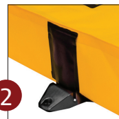
2 A simple tug locks wall in upright position.