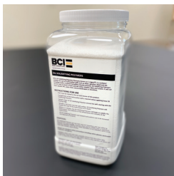
1 GALLON LOOSE IN JUG SKU: CIA001