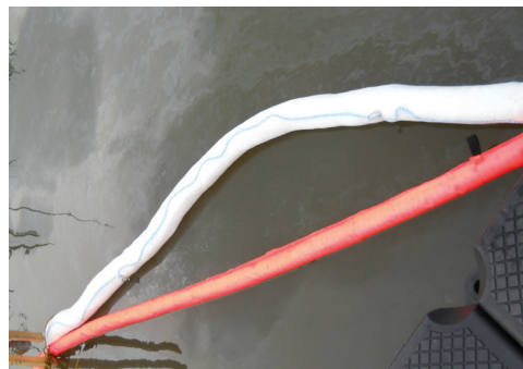
Sheen Boom and Marine Boom collect sheen and hydrocarbons on the surface of the water where currents and wind are an issue.