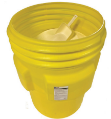
200 lbs. LOOSE in 95 GAL DRUM SKU: CIA200