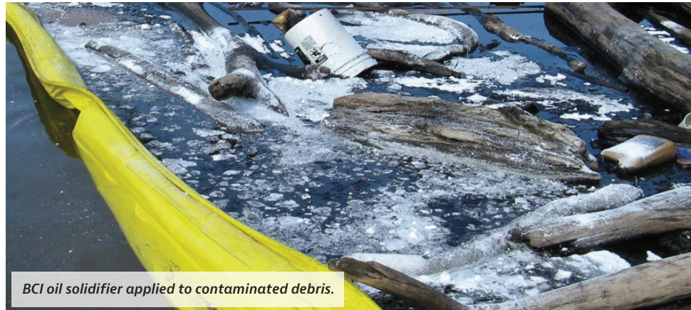
BCI oil solidifier applied to contaminated debris.

A proprietary blend of USDA food-grade polymers that are non-toxic, non-corrosive, non-carcinogenic, and non-hazardous. our polymers (formerly known as CIAgent) are listed on the EPA National Contingency Plan Product Schedule as a "Solidifier" for use on oil spills in the navigable waters of the United States. They solidify hydrocarbons into an inert, solid, rubber-like mass as it suppresses their harmful vapors.